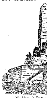
THE LINCOLN MONUMENT AT SPRINGFIELD.

THE LINCOLN BODY IN NEW YORK. The body of the late President is being transported to New York for a final viewing. The crowd of people is expected to be large.