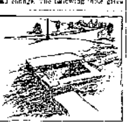
THE LINCOLN BODY IN NEW YORK.

NO REST FOR LINCOLN. The late President Lincoln's body is being prepared for a final resting place. The process is being carried out with the utmost respect and care.